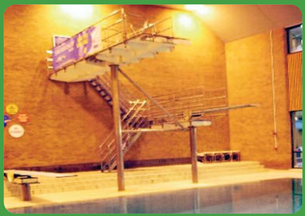
Dolphin Centre Diving Pool