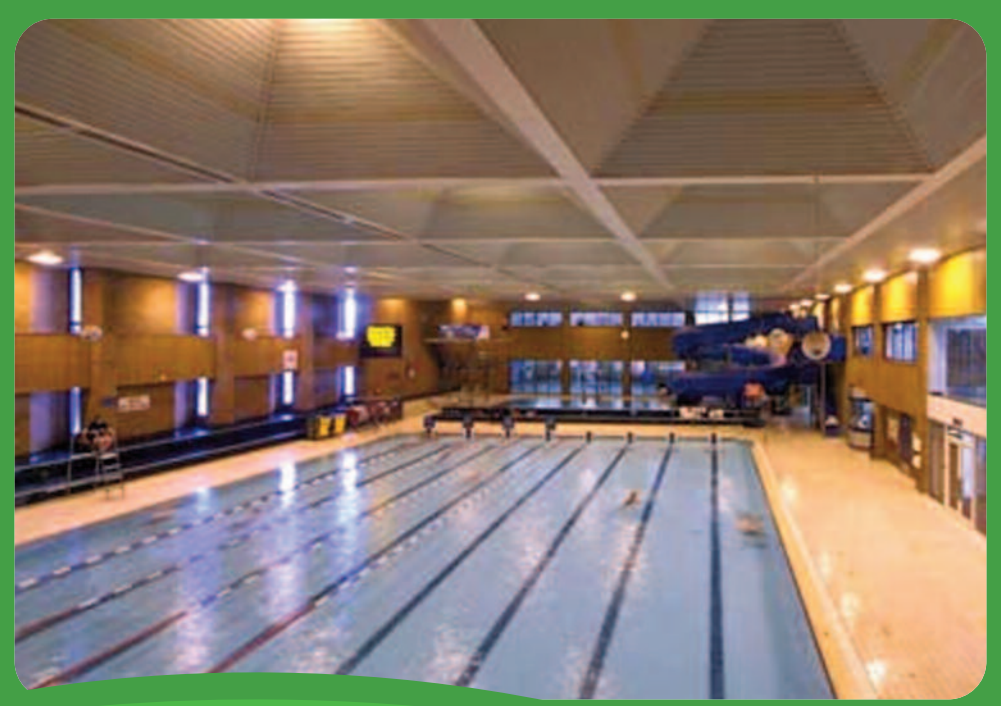
Dolphin Centre Swimming Pool